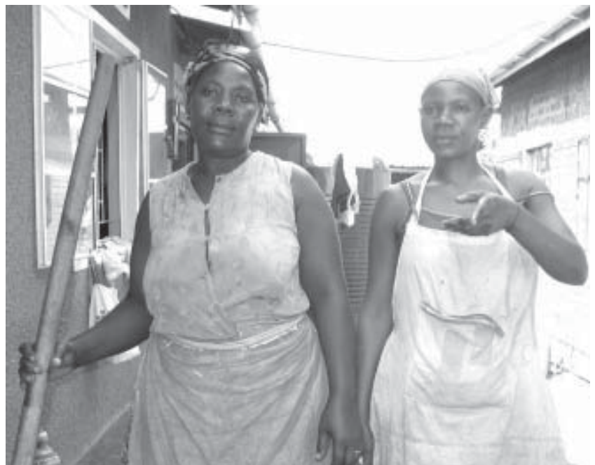
Mama Zidoolo and Mama Claire getting ready to serve lunch.

One day Aunt Nabukenya was sick. Some men were hired to cook food that day but they burnt it.